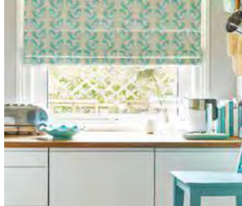
Scandinavia provides perfect inspiration from natural beauty and simple design and is bang on trend right now.