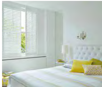
For modern contemporary shutters draw inspiration from the States.