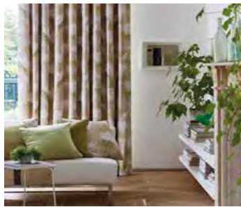
Bring the outdoors in.