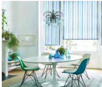
Hints of tropical green hues create a natural look and feel, perfect for any room.